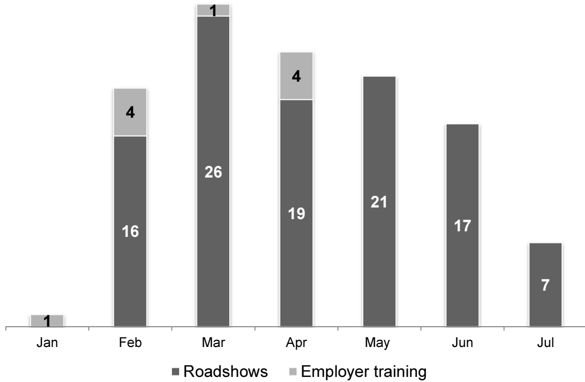
Number of roadshows / training sessions (as of 29 July)